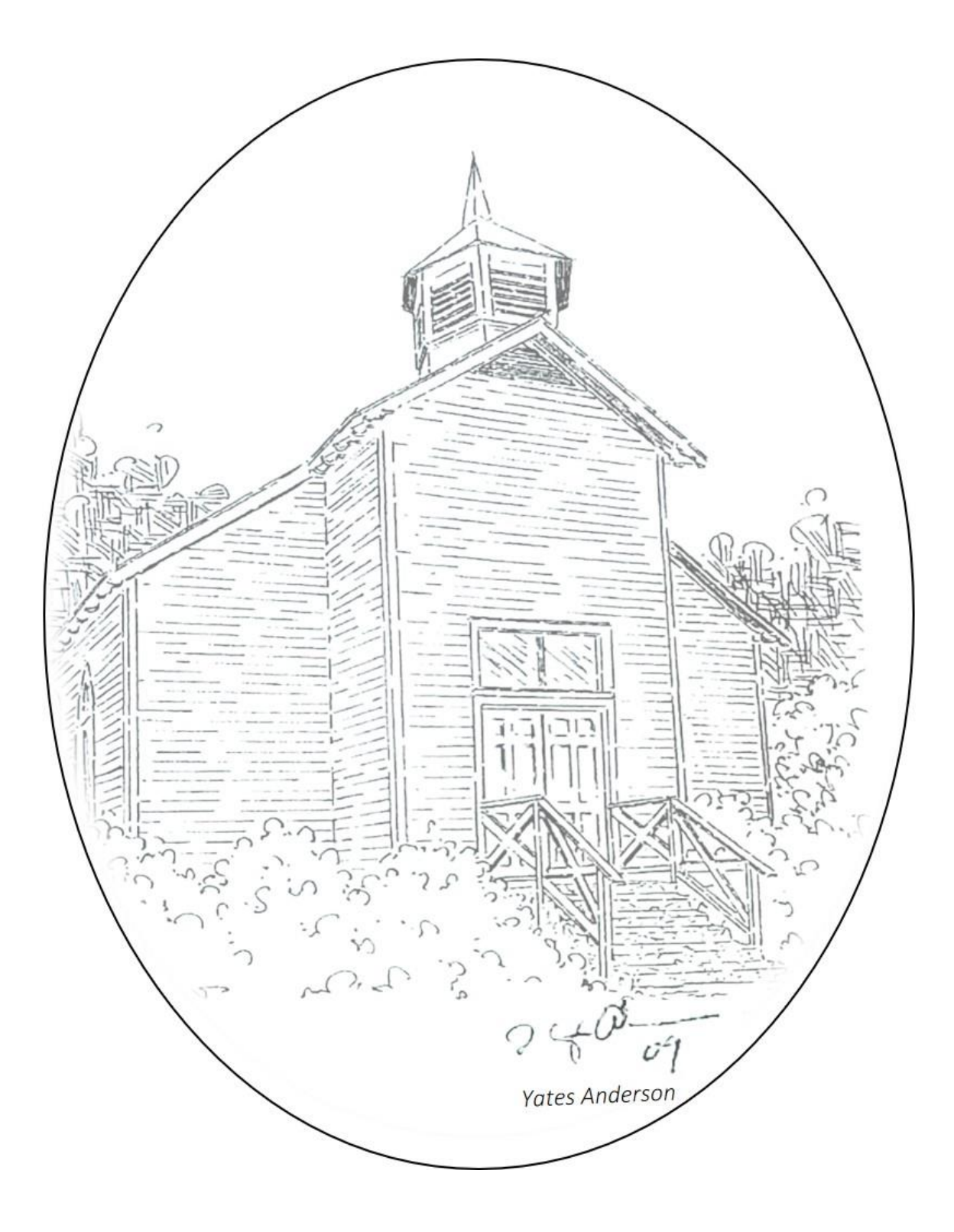
Lake Toxarvay United Methodist Church Sunday, May 30th, 2021